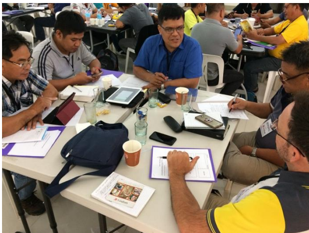
Hard work in small groups.

Because few people were invited per denomination, the material was passed on to people from the same group in many places.