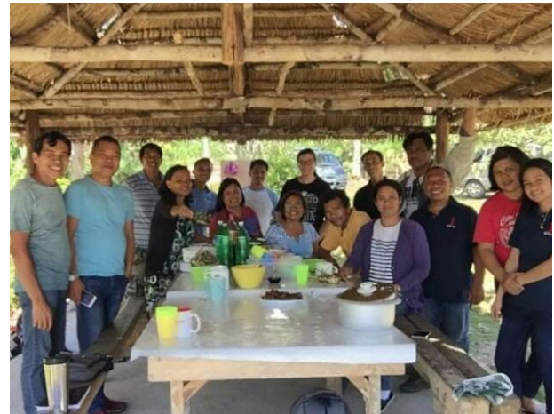
Group in Samar and Leyte, meeting at the ocean.