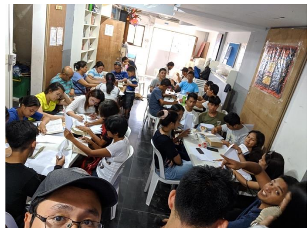
Training in the Slums of Manila