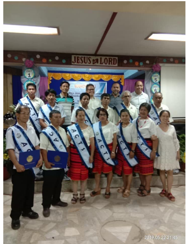
ACTS Ifugao (bergstammen)