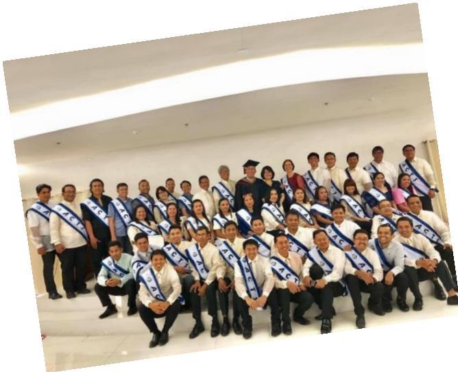
ACTS leerkrachten training