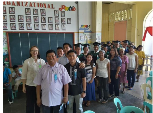
all ready to march...

Most of the 27 graduates work as a minister, missionary or church worker!